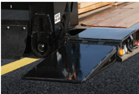
42" Front Ramps with Spring Assist and an 11° Load Angle