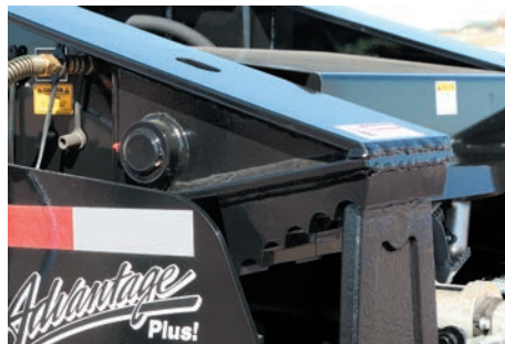
Adjustable Arch Gooseneck