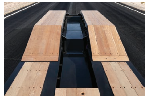
Full Depth Boom Trough in Wheel Area