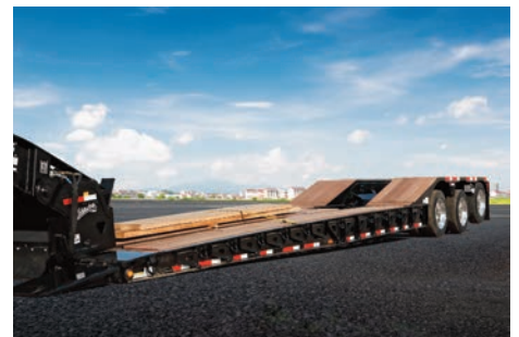
4-Beam Tapered Deck Main Frame Construction

A TRAIL KING WON'T JUST GET THE JOB DONE - IT WILL GET THE JOB DONE RIGHT.