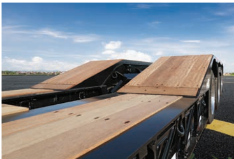
18° Rear Slope with Knife Edge Transition to the Deck

Trail King has taken our bestselling detachable lowboy and integrated its top features into the Paver Special. The dependable load-hauling strength, durability and versatility can stand up to any challenge. Easy load angles with a low profile for ease of loading equipment such as asphalt pavers and rollers.