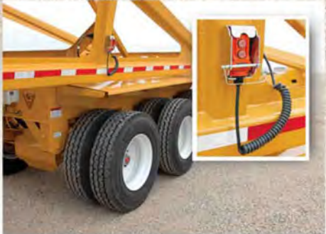
Optional Variable Gate Control