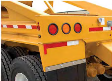
Two-Component Paint Finish The entire trailer is primed and painted with a two-component polyurethane primer and paint, after which electrical lines are installed.