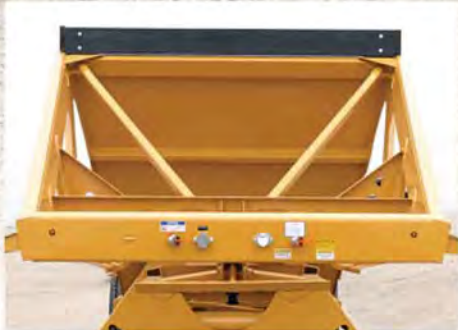
Lightweight Cross Braces tie the frame together in a way that minimizes the flexing and twisting that can cause cracking in critical stress areas.