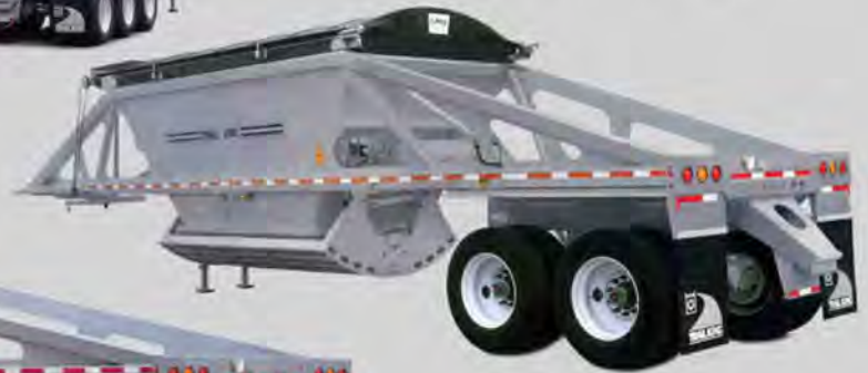
Tandem Axle Bottom Dump