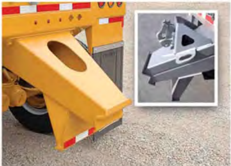
Bolt-On Push Block (also available with pinte hitch)