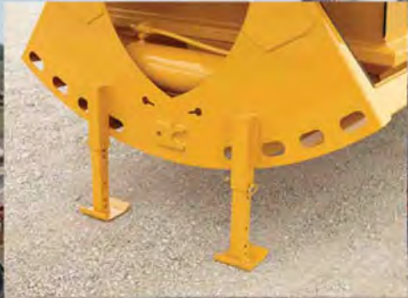
Pin-Style Landing Legs