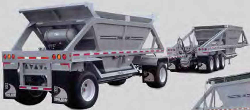
Bottom Dump Trains