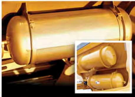
Large Air Reservoir, with air system oiler, means both longer operating time and better control. Optional dual-tank configuration (see inset).