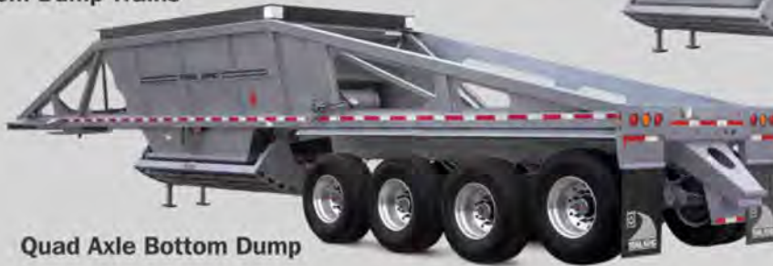
Quad Axle Bottom Dump