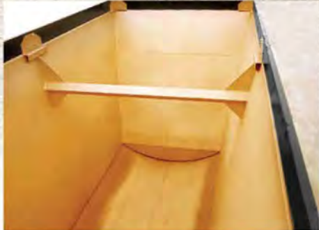
One-Piece Unitized Design of the hopper and frame simultaneously provides optimum strength and maximum weight savings.