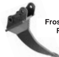
Frost & Rock Ripper