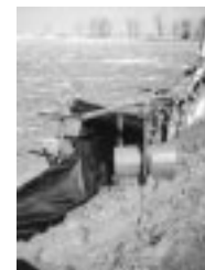
Silt Fence Installer