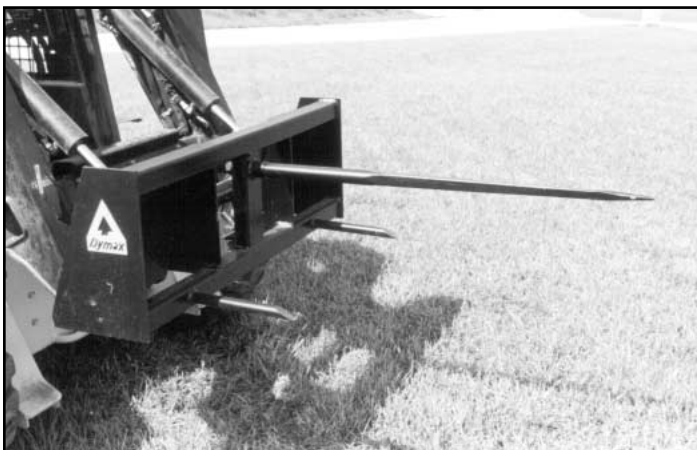
Bale Spear with single 44" spear.